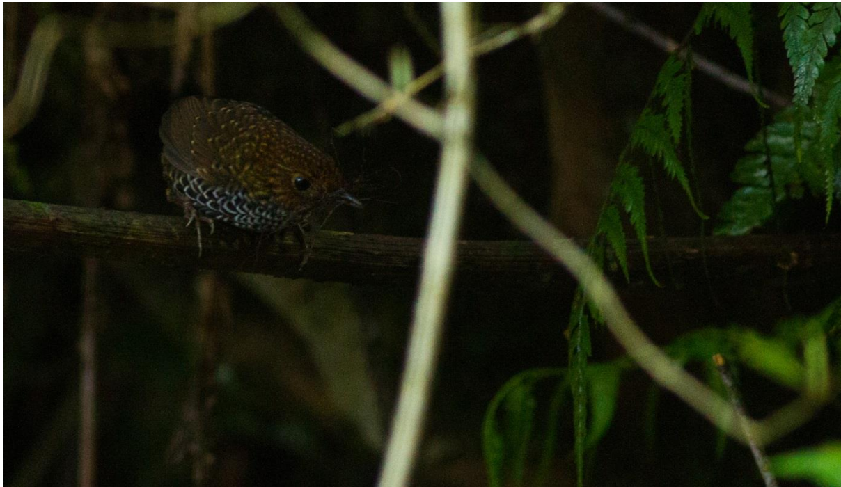
Taiwan Cupwing (Wren Babbler)

number 23). Within minutes, standing at the same spot, we encountered a small flock of Silver-backed Needleetails and an Ashy Woodpigeon in flight. Buoyed by the success, we doubled our efforts in search of the 2 remaining laughingthrushes. Luckily at one stop with lots of fallen mossy logs, we came across a Taiwan Wren Babbler (as it collected nesting material). It was an enormous relief – to be able to score a difficult bird with relative ease. 4 more endemics to go for the “cleanup”. At this point, a White-browed Shorting started calling and seemed very close. But even after half an hour of trying, we failed to get a visual of the bird. At one point, the bird flew across the road but it was just a blur.