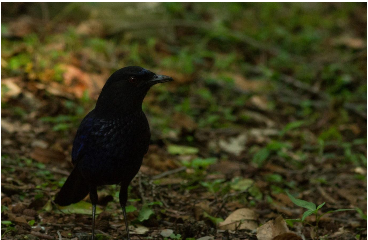
Taiwan Whistling Thrush