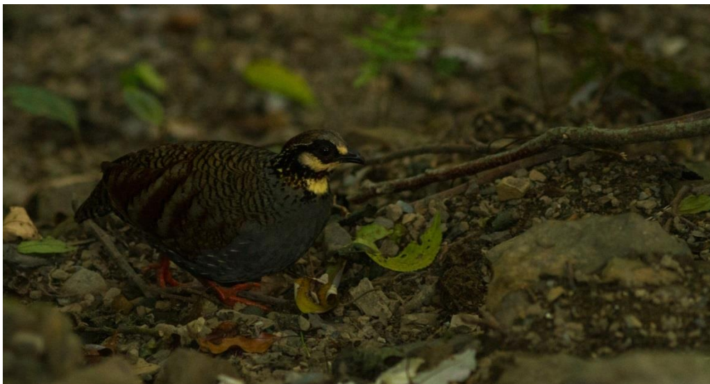
Taiwan Hill Partridge