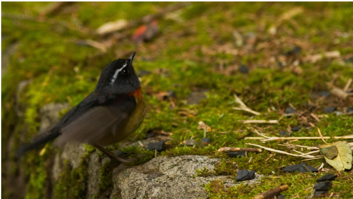
Collared Bush Robin