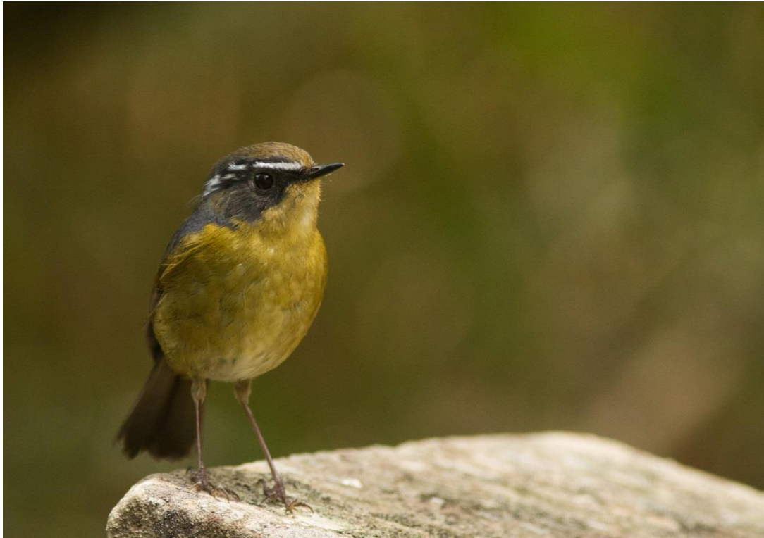
White-browed Bush Robin