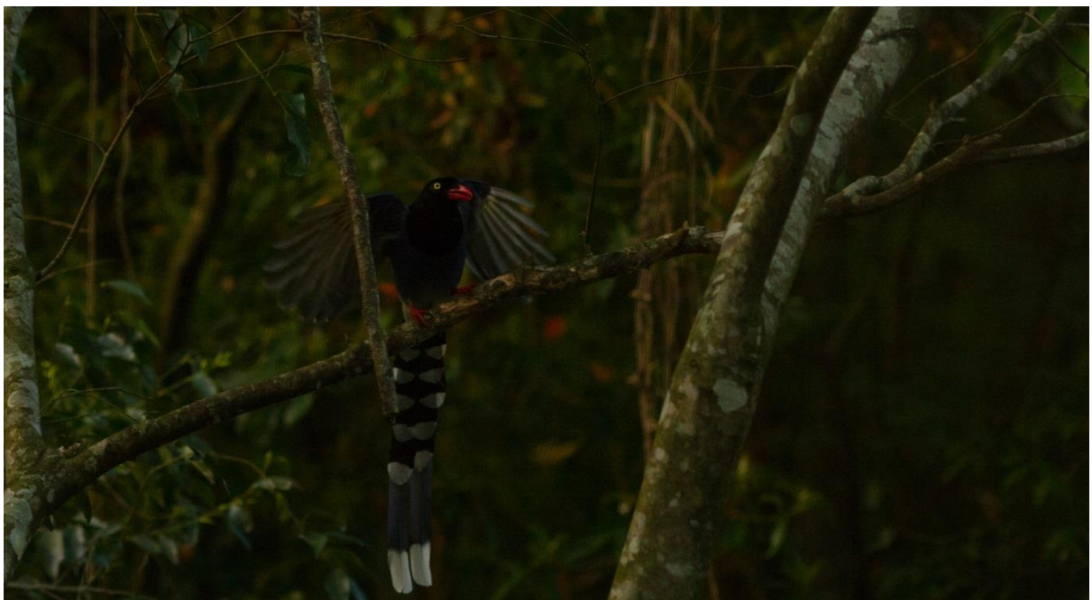
Taiwan Blue Magpie