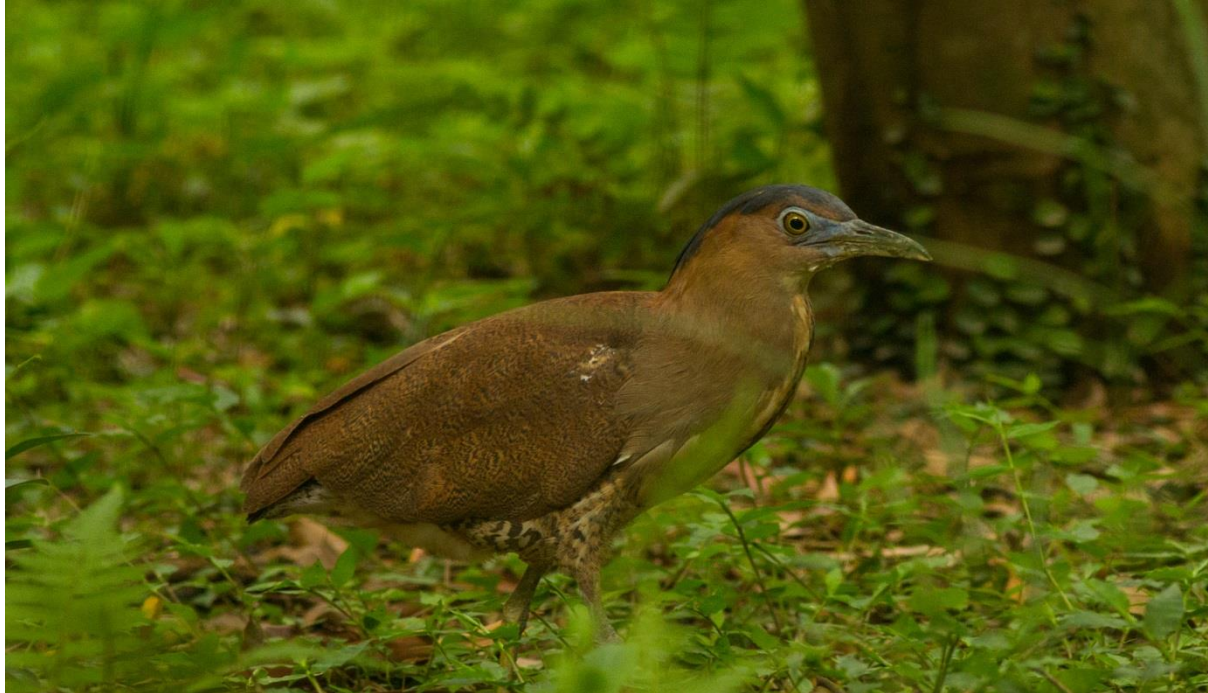
Malayan Night Heron

The short 2.5hr flight from Incheon to Taipei was delayed by about 40mins. We touched down in Taoyuan as the rain clouds loomed ominously over the city. The first birding location after checking into our hotel was the Botanical Gardens. The highlights were a pair of very tame Malayan Night Heron and a Taiwan Scimitar Babbler .