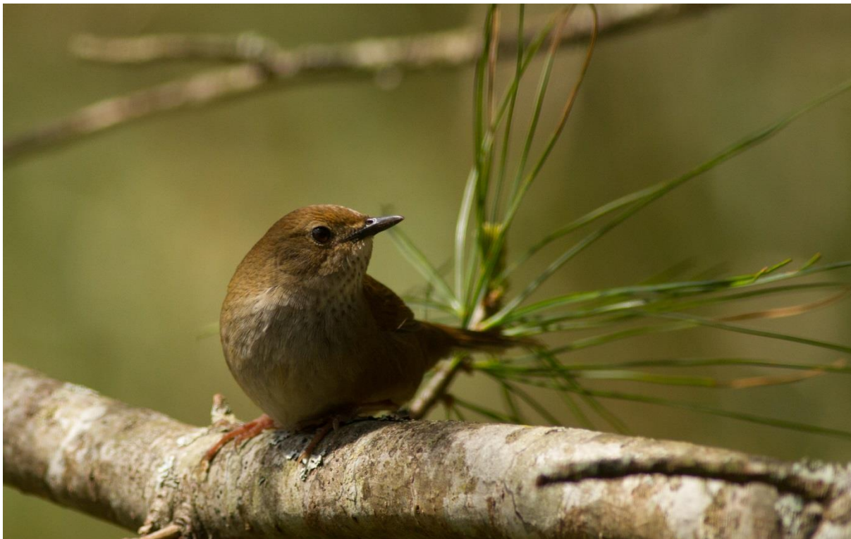
Taiwan Bush Warbler

We spent the early morning waiting at the 47K point on the road for Mikado Pheasant but none were to be found. Later in the morning, we went up to the summit and had very close views of Taiwan Rosefinch and Grey-headed Bullfinches being fed by photographers. A pair of Eurasian Nutcrackers were seen from the road. Near the summit pond, we had absolutely cracking views of a Taiwan Bush Warbler – singing its heart out! After lunch, we birded the stretch of the road between 37K and the entrance. We tried at multiple places for the laughingthrushes. At one point, a pair of Rusty Laughingthrushes came close to the road but only Marco was able to get very short views. At about 3pm, we went back to the 47K mark and this time was rewarded by stunning views of a Mikado Pheasant . (The cover photo)